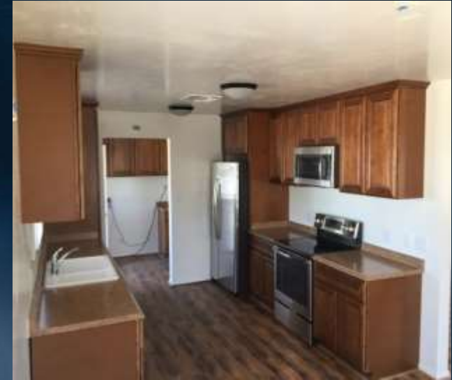
Example of Updated Kitchen