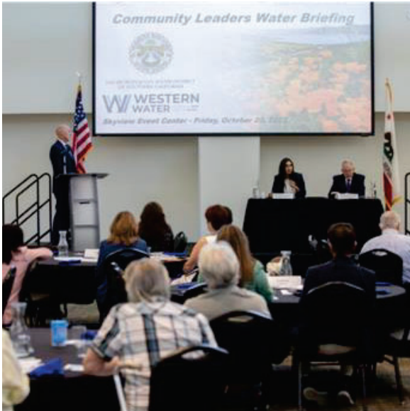
Western GM Craig Miller moderates the event with Senator Roth and Assemblymember Cervantes