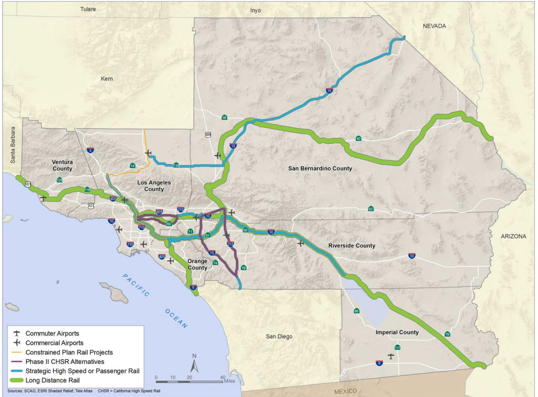
EXHIBIT 3 Strategic Plan HSR Map