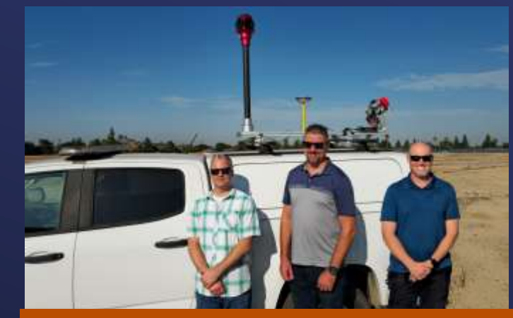
Field Survey Team