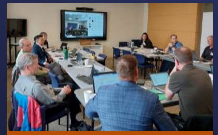
Value Engineering Workshop