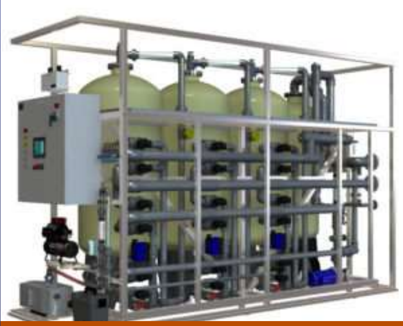
Granular Activated Carbon Skid